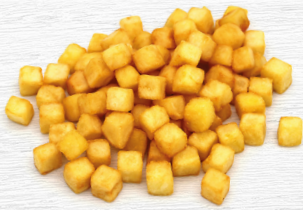
Cubes 12/12/12 mm