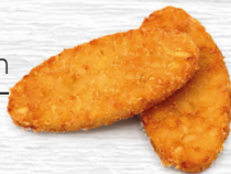
Oval Crunchy Hash Brown

Other Lutosa's products ideal for breakfast and brunch :