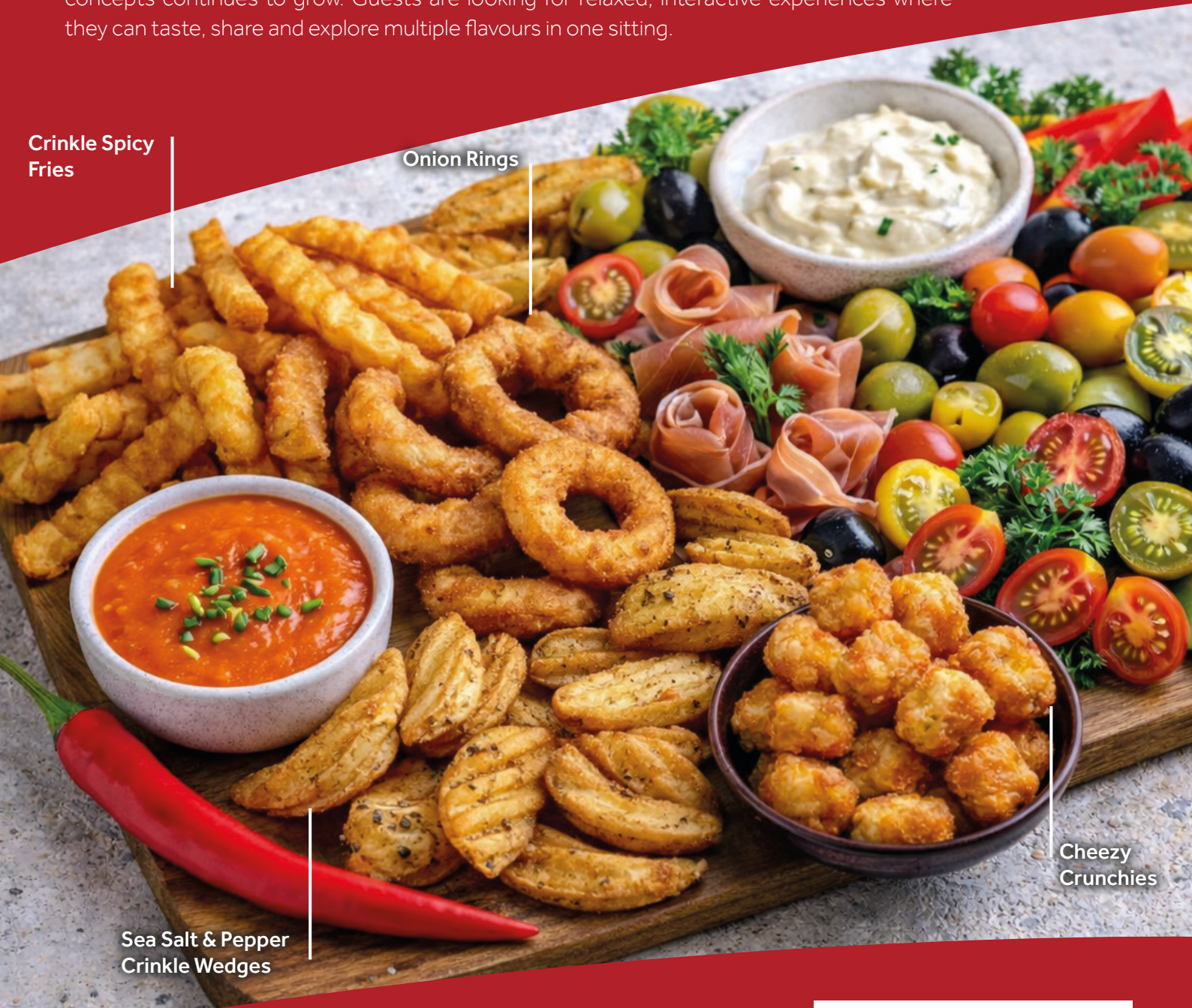
Crinkle Spicy Fries

Cruise dining is increasingly shaped by sociability and discovery. Across casual venues, pool decks, food halls and themed restaurants, the demand for tapas-style dining and sharing concepts continues to grow. Guests are looking for relaxed, interactive experiences where they can taste, share and explore multiple flavours in one sitting.