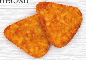
Rustic Hash Brown