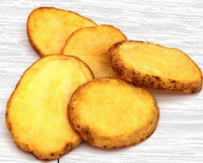
Rustic Slices 9 mm skin-on