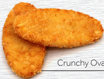
Crunchy Oval Hash Brown