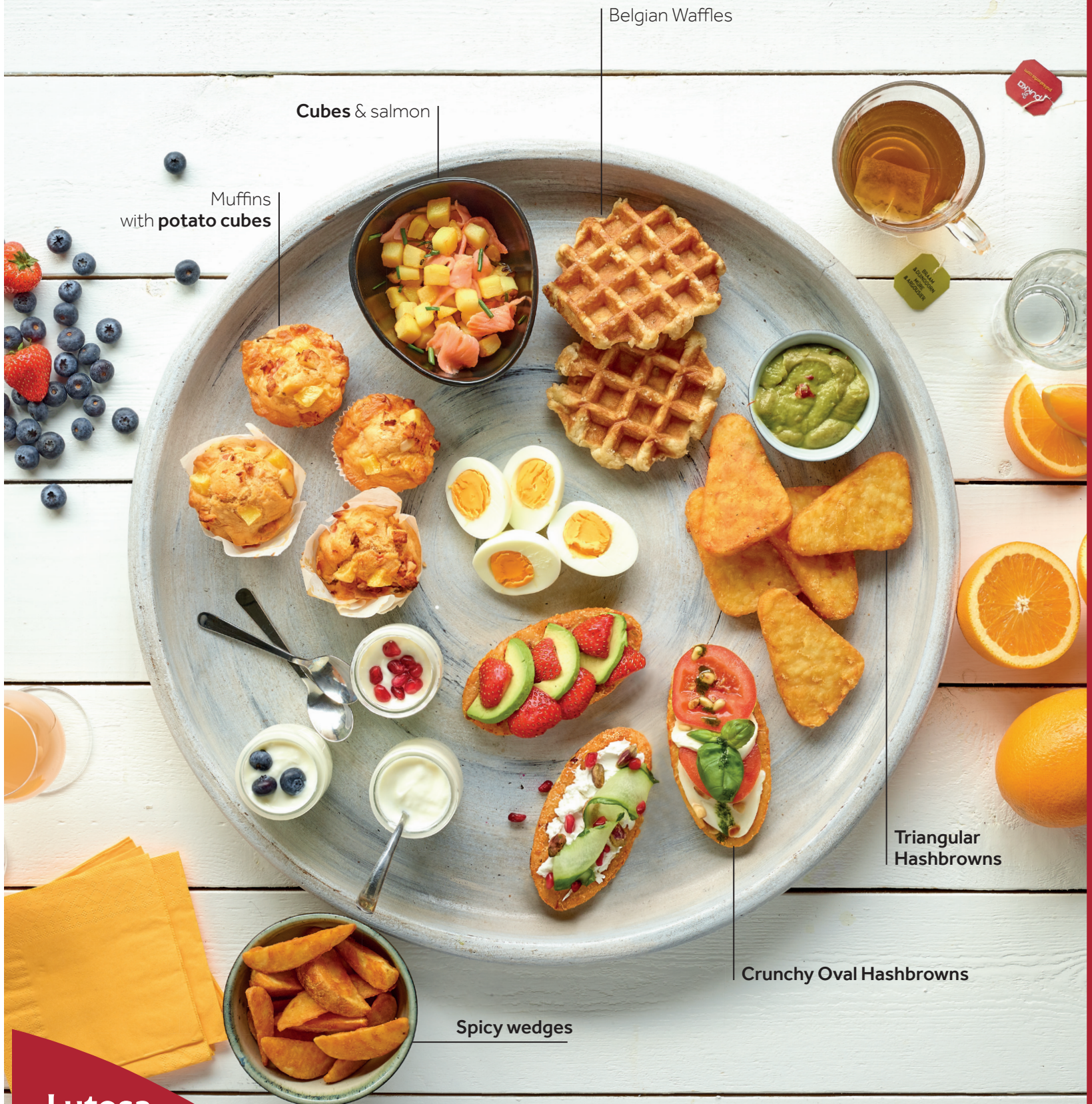
Cubes & salmon

Brunch, the new weekly rendez-vous for food lovers. "Brunch" is a contraction between the words "Breakfast" and "Lunch" indicating the moment of eating. Generally, brunches take place between 10 am and 3 pm on Sundays. The brunch is becoming increasingly popular in cafés and restaurants. They provide quality time to families and friends and offer the opportunity to taste sweet and savoury products. Brunch offers a wide variety of dishes and you can find in our large product portfolio the best product to fit your recipe: from potato slices to hashbrowns, from genuine potato taste products to flavoured specialities.