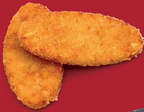
Crunchy Oval Hashbrown

Try our Crunchy Oval Hashbrowns with different toppings. Sweet or savory, let your imagination run free and impress your customers. This setting is perfect for on a shared plate, brunch setting, buffet and Grab&Go.