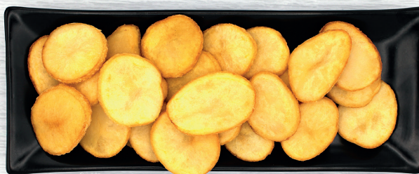
Slices 5/7 mm