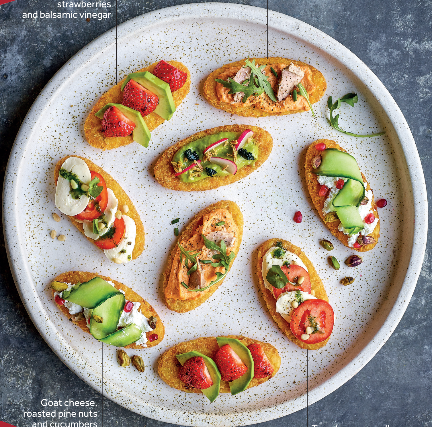
Goat cheese, roasted pine nuts and cucumbers