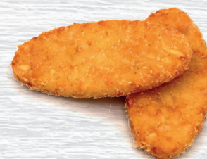
Crunchy Oval Hashbrown