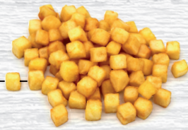
Cubes 12/12/12 mm

options are looking for nutritive, high quality and tasty food. Our Greek Breakfast Muffins Recipe, using Lutosa-potato cubes is perfectly suited for this new demand: Easy to carry and highly delicious!