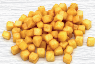
Cubes 12/12/12 mm