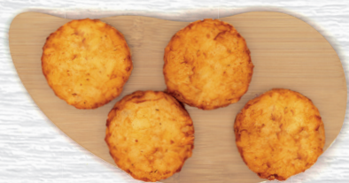
Rösti with Onion taste